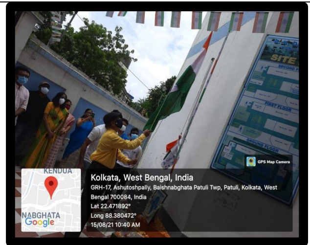
Independence Day Celebration, 2021