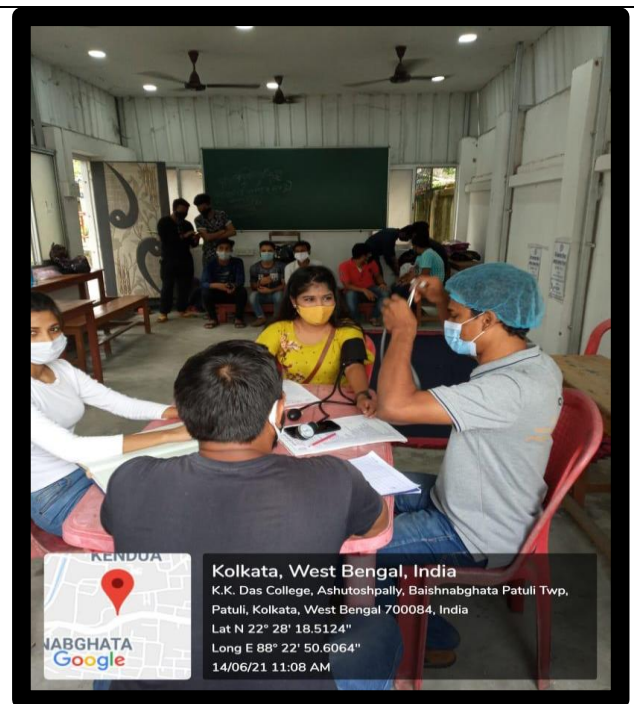
Blood Donation Camp 2021